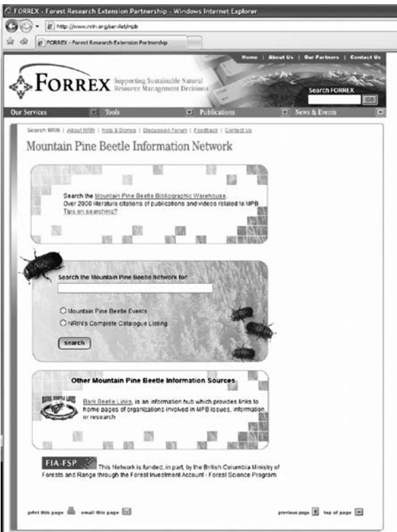
The new and improved search interface uses Reference Manager Web Publisher as its search tool.